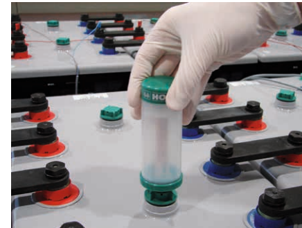
Figure 1: Inserting the AquaGen I

The AquaGen is vertically inserted into the correspondingly prepared bayonet plug ( Figure 1 ), and is pressed into the bayonet plug until reaching the stop by means of slight rotary movements ( Figure 2 ). Now, the AquaGen is fully mounted ( Figure 3 ).