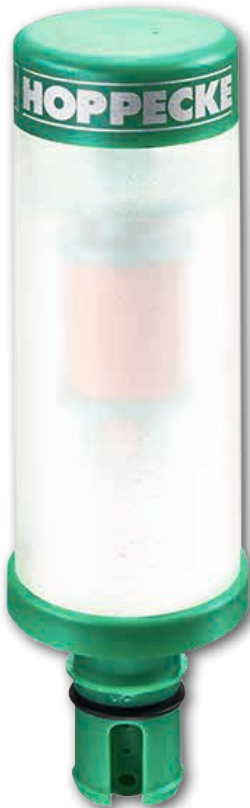
grid | AquaGen pro max