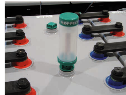
Figure 3: Assembly of AquaGen