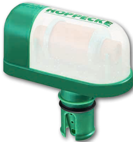
grid | AquaGen pro