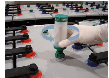
Figure 2: Inserting the AquaGen II