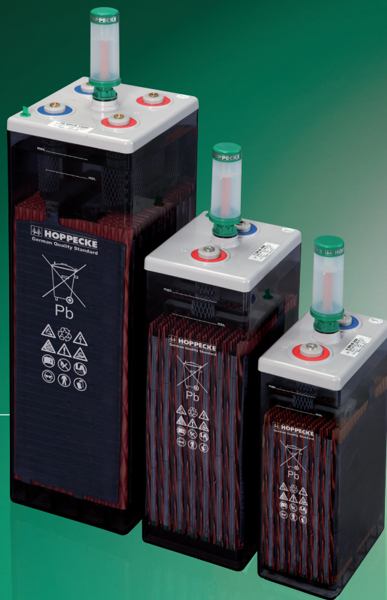
Similar to the illustration, AquaGen® optional