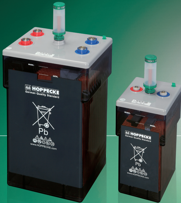
Similar to the illustration, AquaGen® optional